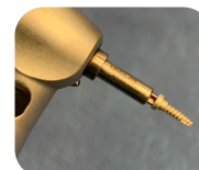
Membrane fixation screws machined from nanoMAG's BioMg250 and tooling compatible with standard dental handpiece