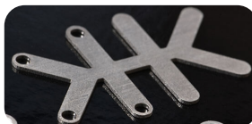
nanoMAG's BioMg 250 magnesium frame laser-cut to provide polymer membrane reinforcement

The Resource Center has supported a transition to go-to-market manufacturing methods under design controls